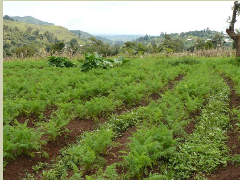
A Carrot Farm